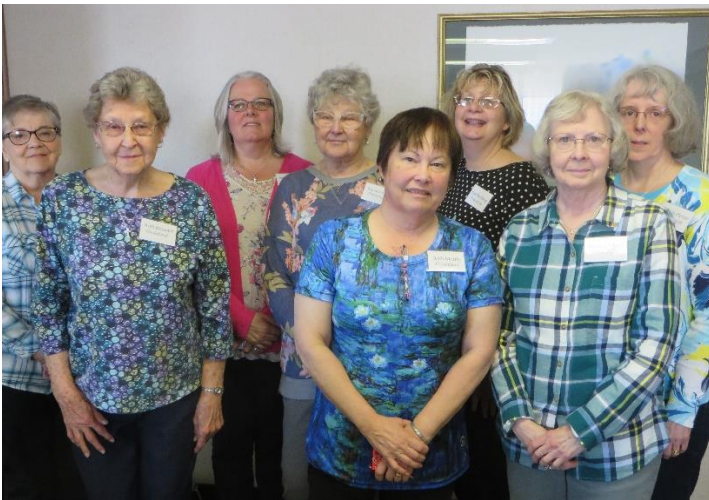
Ontonagan, Rockland, and Greenland were well represented