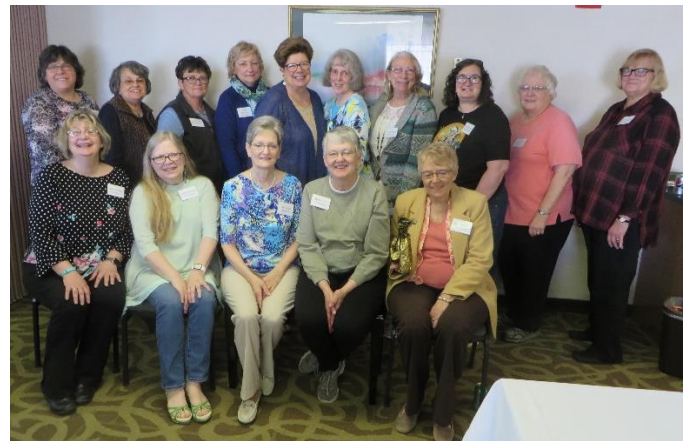
District Leadership Team