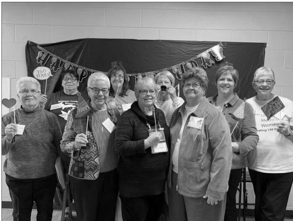
Midwest District leaders celebrate UMW at the Conference Annual Meeting in October.