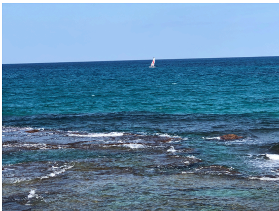
On the Sea of Galilee. Mediterranean Sea.